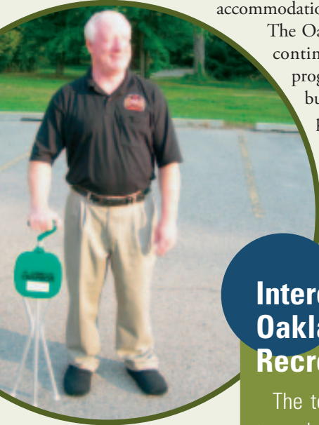
Seat Canes, one component of adaptive recreation equipment at Oakland County Parks, are a small folding chair attached to a cane available for patron use at the parks.

The Oakland County Parks and Recreation Commission will continue to expand and improve its adaptive recreation programs and services. By working with other agencies, building partnerships, and meeting with parents and participants, the Oakland County Parks Adaptive Recreation program hopes to offer more unique equipment, facilities and services to enhance quality of life for all individuals.