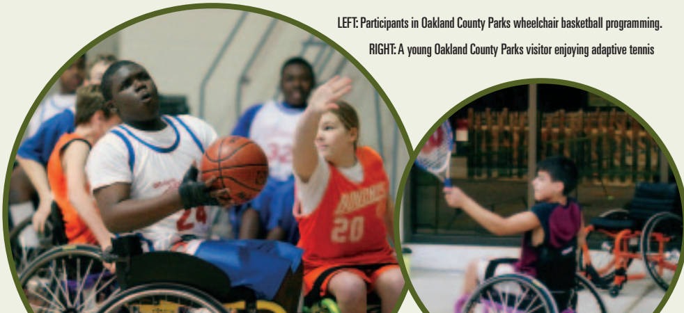
RIGHT: A young Oakland County Parks visitor enjoying adaptive tennis